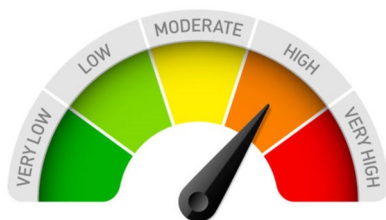
• EXPECTATIONS OF GOD